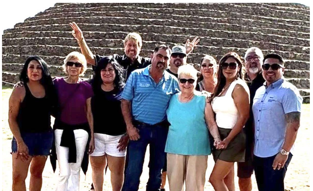
District 5230 Rotarians visiting Guadalajara, Mexico for a Hospital Service project (and touring!)